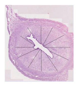
Figure 3. Microscopic measurement of endometrial thickness with 400 times magnification

Effect of Chitosan Administration for the Endometrial Thickness Induced by Lead